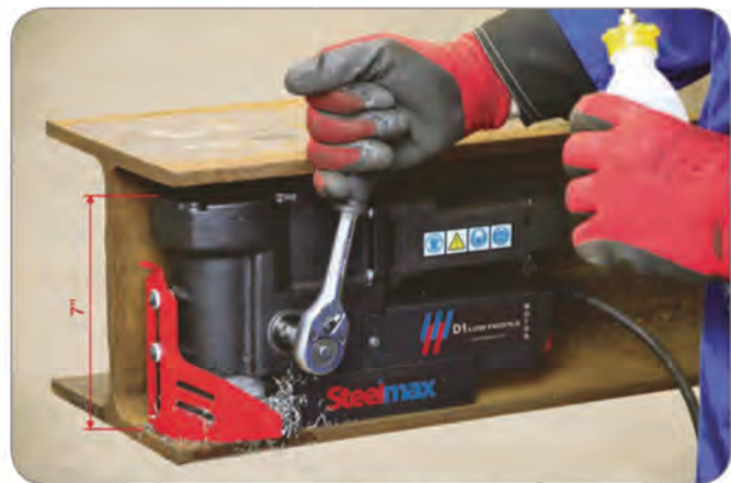
The D1 Low Profile fits in the tightest spots